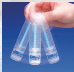
Mix to suspend.