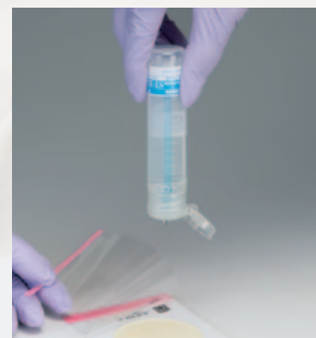
Squeeze to dispense.