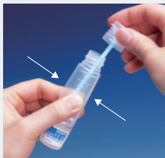
Squeeze swabbud to remove excess diluent.